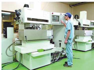
Wire cut EDM

The slogan, one company one technology, in a few words stands for the excellence of the technology and the dedication of the company that Gunma Prefecture considers extraordinary. The Company is proud of, employs, improves and refines the technology, and the Prefecture appreciates that without it the Prefecture could not prosper in the manufacturing industry.