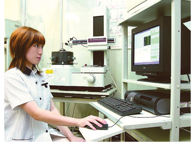
Roundness test instrument

Only the products which pass the stringent quality tests can reach the customers.