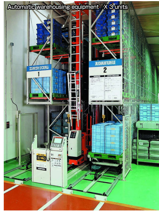
Automatic warehousing equipment X 3 units