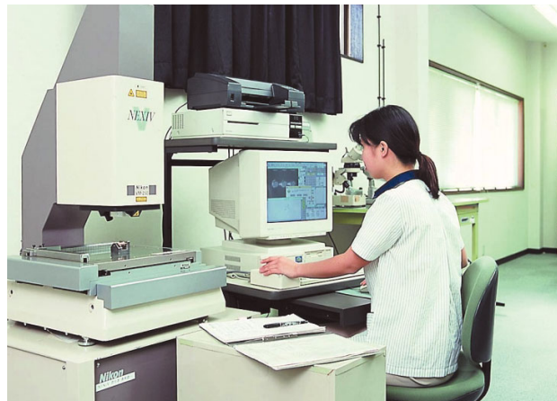
CNC image measuring system