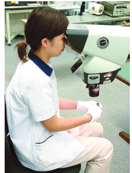
Mantis vision system