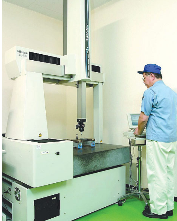
Coordinate measuring machine